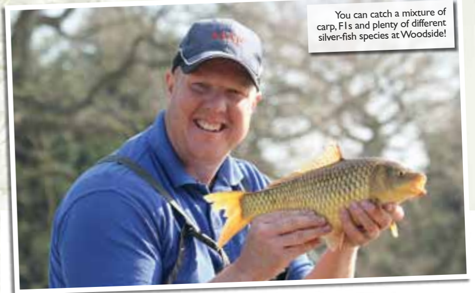
You can catch a mixture of carp, F1s and plenty of different silver-fish species at Woodside!

It was proper T-shirt weather now and I was almost contemplating applying Ambre Solaire! Errrr, sun's out, guns out, woo hoo!