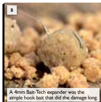
A 4mm Bait-Tech expander was the simple hook bait that did the damage long.