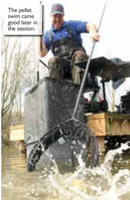
The pellet swim came good later in the session.