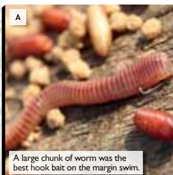
A large chunk of worm was the best hook bait on the margin swim.