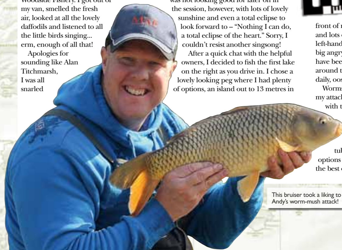
This bruiser took a liking to Andy's worm-mush attack!

After a quick chat with the helpful owners, I decided to fish the first lake on the right as you drive in. I chose a lovely looking peg where I had plenty of options, an island out to 13 metres in