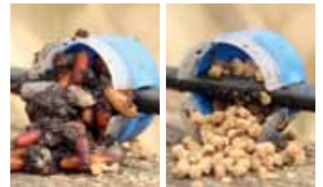
A worm and caster mush was fed down the margins, while a simple pellet attack did the damage in open water.

The margin swim went quiet for a while, so I introduced a big pot of worms and casters and decided to leave it. Big carp were all over the surface now, just cruising around in the lovely warm sun! >>>