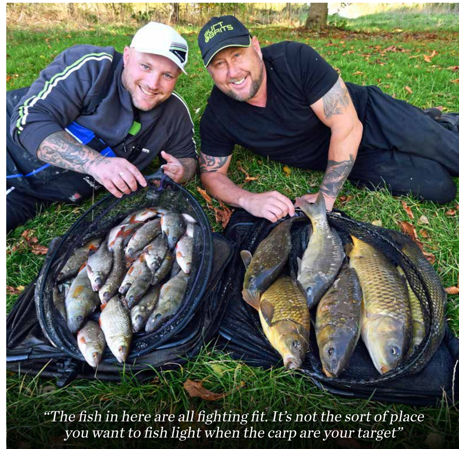
“The fish in here are all fighting fit. It's not the sort of place you want to fish light when the carp are your target”